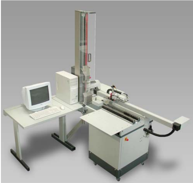
Robotic testing system 'roboTest L' with testing machine 2.5 kN