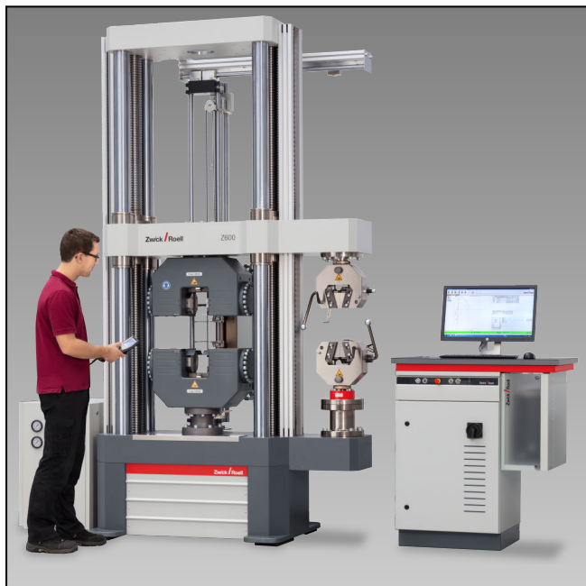
Z600ES with hydraulic grips