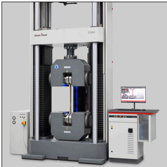
videoXtens L 6-680 HP on Z2000E